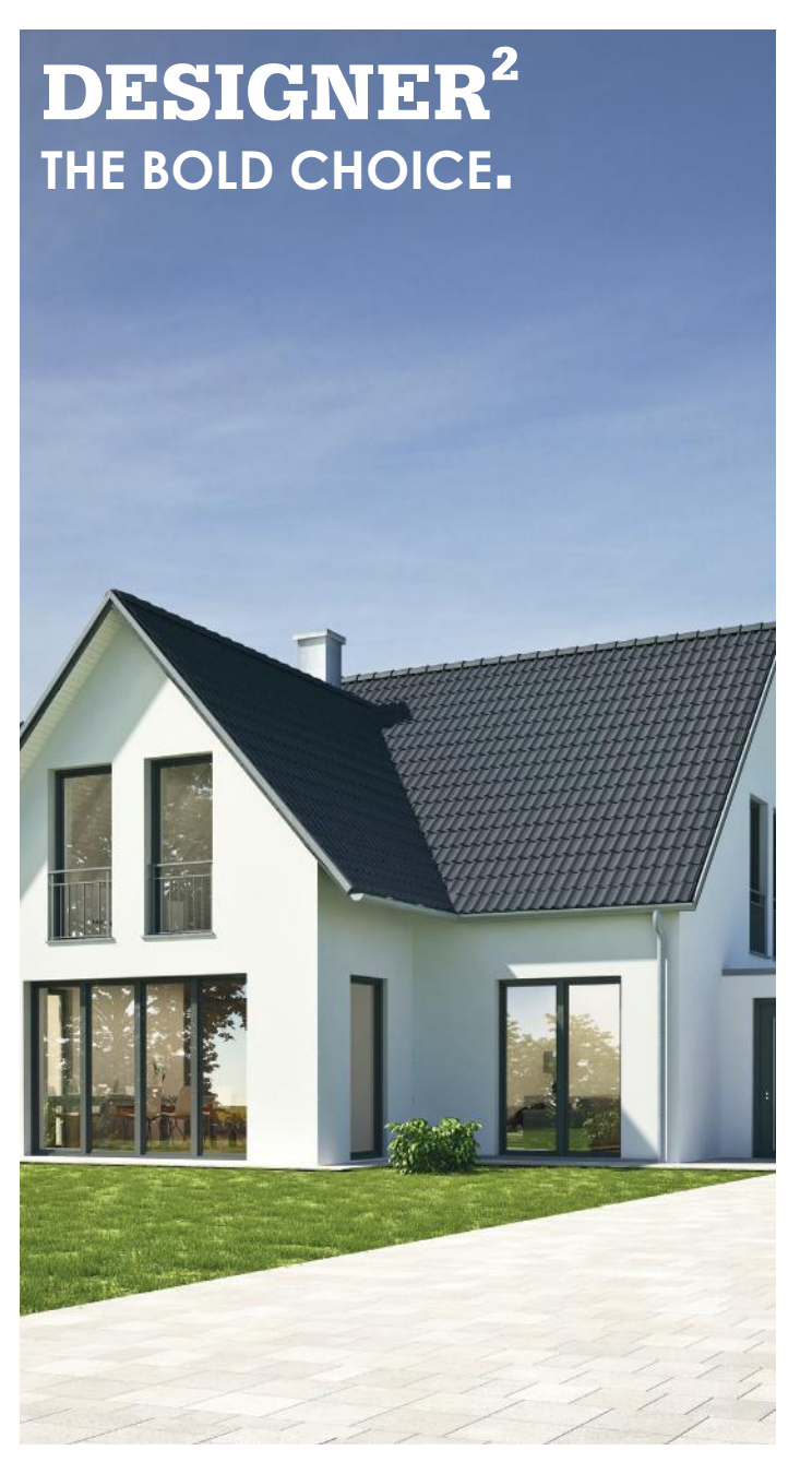
STRAIGHT LINED INNOVATION. BOLD LOOKS CREATE A BRIGHT LIVING ENVIRONMENT.