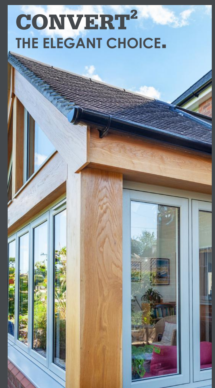
FEELS ELEGANT AND TIMELESS. FOR THOSE WANTING A CONTEMPORARY LOOK IN A TRADITIONAL BUILDING.