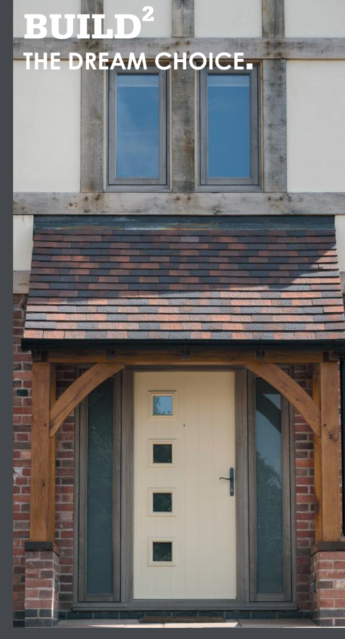
COMPLETE YOUR DREAM PROJECT. SIMPLICITY STANDS OUT; BE SQUARE.