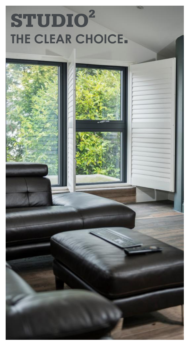
VERY CLEAR IN ITS' DESIGN. WITH A CUTTING EDGE INTERNAL SHAPE IT IS UNCONVENTIONAL AND UNIQUE.