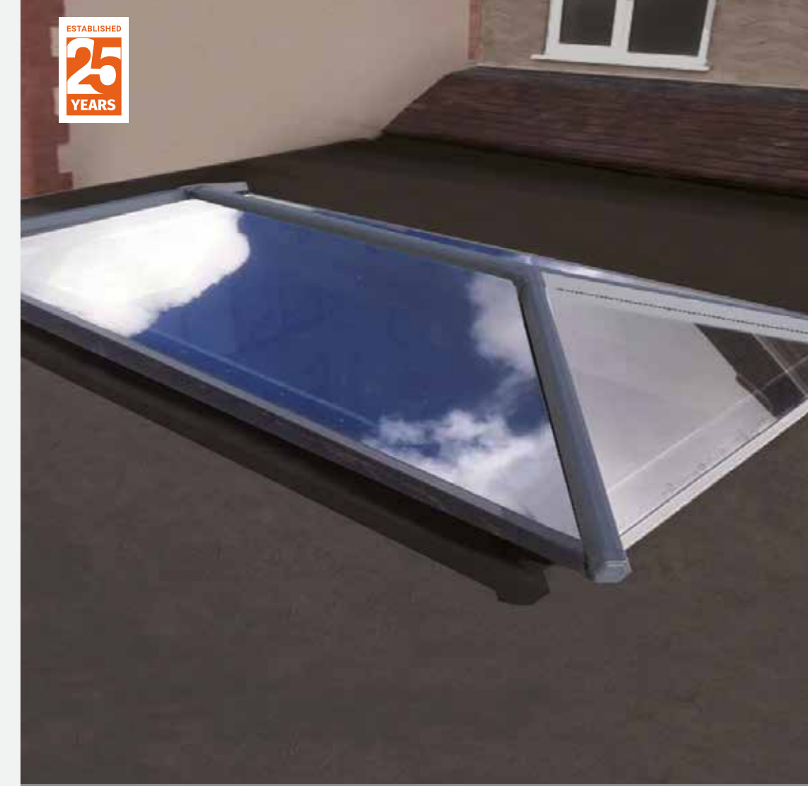
Simple, Stylish Roof Lanterns